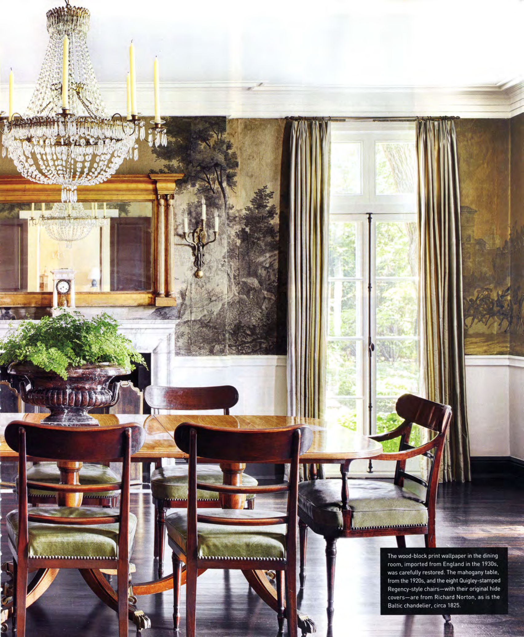
The wood-block print wallpaper in the dining room, imported from England in the 1930s, was carefully restored. The mahogany table, from the 1920s, and the eight Quigley-stamped Regency-style chairs—with their original hide covers—are from Richard Norton, as is the Baltic chandelier, circa 1825.