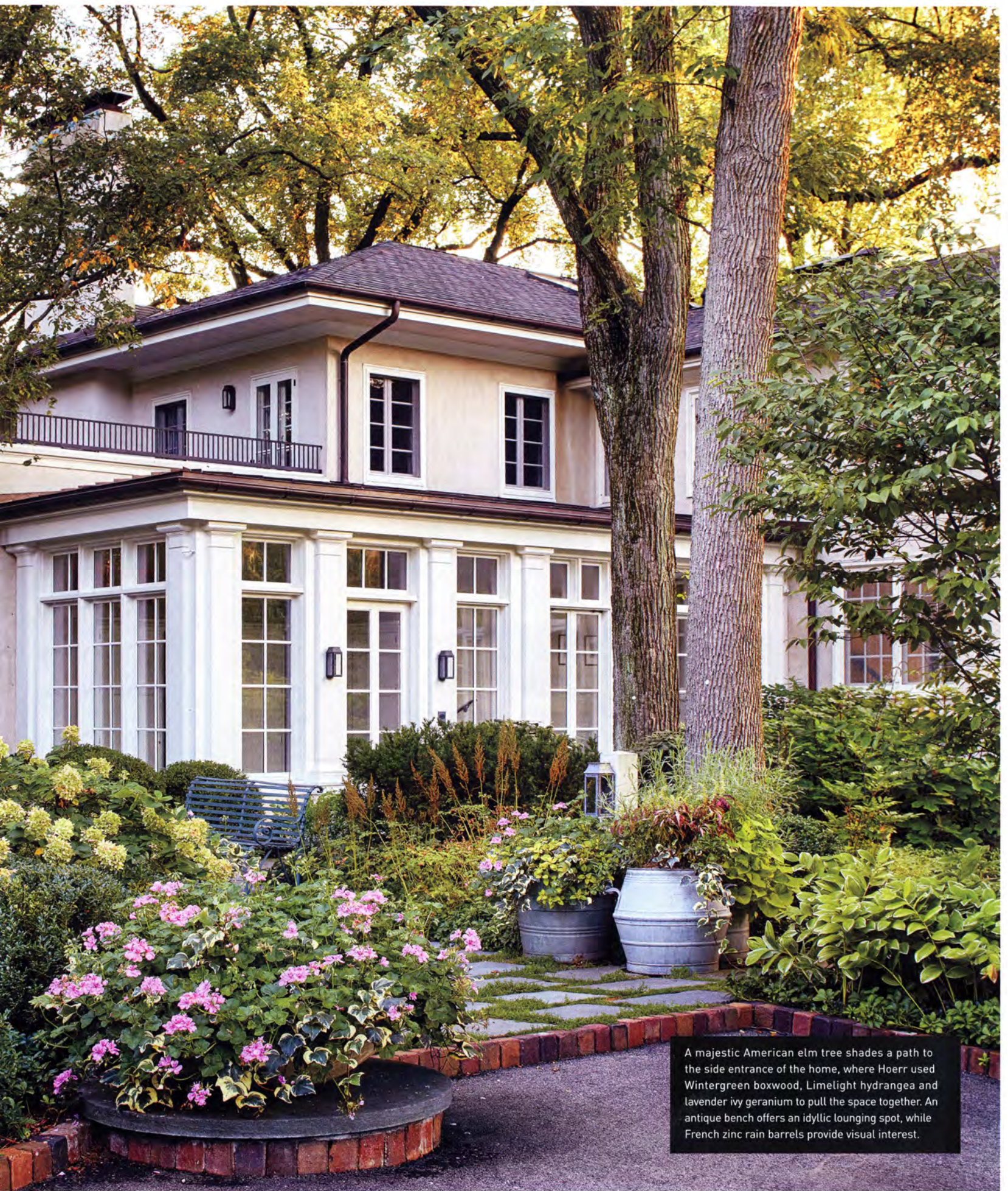
A majestic American elm tree shades a path to the side entrance of the home, where Hoerr used Wintergreen boxwood, Limelight hydrangea and lavender ivy geranium to pull the space together. An antique bench offers an idyllic lounging spot, while French zinc rain barrels provide visual interest.